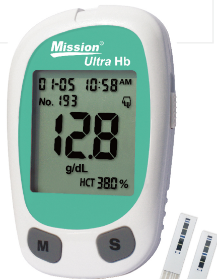
Mission® Ultra Hemoglobin Meter